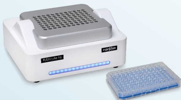
Figure 1. FLEXcyte 96 device with FLEXcyte 96 plate

Here, we present the applicability of hiPSC-CM contractility measurements for chronic toxicological assessment using the high-throughput FLEXcyte 96 system. 15 kinase inhibitors and 3 anthracyclines with well-known cardiotoxic profiles were selected to evaluate the reproducibility of clinical data. The results showed the expected cardiotoxic effects, including negative inotropy and induction of proarrhythmic events and ceased beating in a dosage and timespan dependent manner and proving the advantage of the FLEXcyte system over commonly used cell-based assays for preclinical cardiac risk assessment.