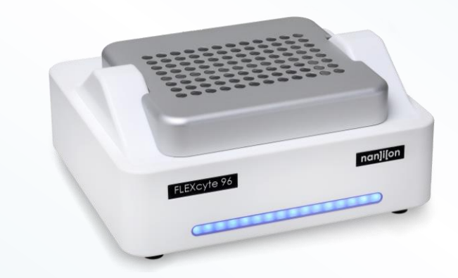
Figure 1. FLEXcyte 96 device for the assessment of cardiac contractility under physiological mechanical conditions

Here, we show that the auxotonic environment of the FLEXcyte 96 enables mature physiological responses of hiPSC-CMs on positive inotropic substances such as L-type calcium channel agonist S-Bay K8644, betaadrenergic agonist isoproterenol and cardiac myosin activator omecamtiv mecarbil.